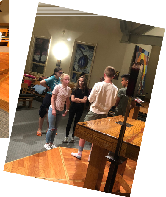
Jack Daniels photos