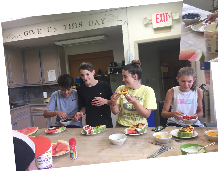
Vacation Frisbee School 2018 Top photo swiped from our terrific CHS website, with thanks to the web-masters. Bottom Two Photos by Michelleslie Maltese-Nehrbass. The snacks looked scrumptious!