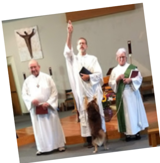
Scout gets a blessing too.

"Our guides repeatedly called out, "Trust your boots!" That was the one piece of equipment they inspected before leaving at the very start of the climb. New boots get you sent home. Broken-in boots a must, so much so, you wear [their uncomfortable bulk] on the plane; the one thing you can't replace if luggage is lost. But you learn to trust them. Plant your foot, balance your weight, shift, turn, lift your body. Plant your other foot. Repeat. I trust my boots. I don't trust my gut though. They say, "trust your gut," but I think that's wrong. Your gut is a mash up of under-thought intuition, amorphous fears, vague notions, and unfounded feelings of confidence. . . . Better to trust your boots. I mean by boots, of course, the people I love and the traditions and the honed and broken-in powers of reason and thoughtfulness, the practice of daily prayer and reading. All leading to the presence and meaning and purpose of the one in whom we live and breath and hike with."