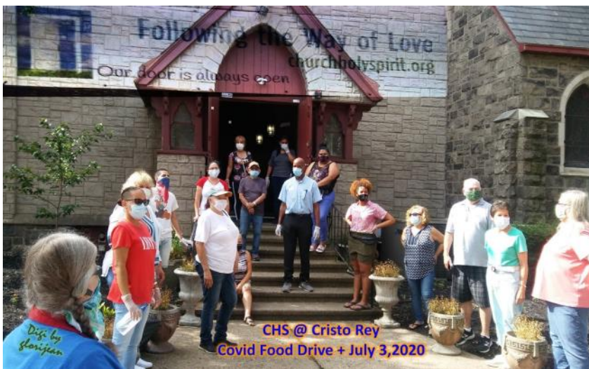
CHS @ Cristo Rey Covid Food Drive + July 3, 2020