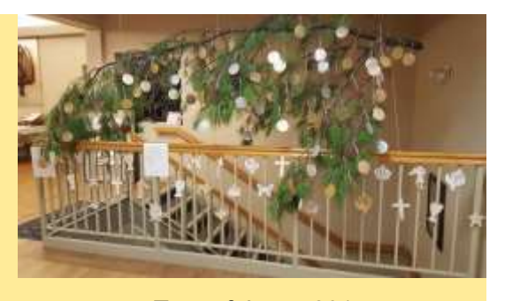
Tree of Jesse 2015

Tuesdays from 4—5 pm: November 6, 13, 20, 27; December 4, 11 Communion Class Celebration Sunday, December 16