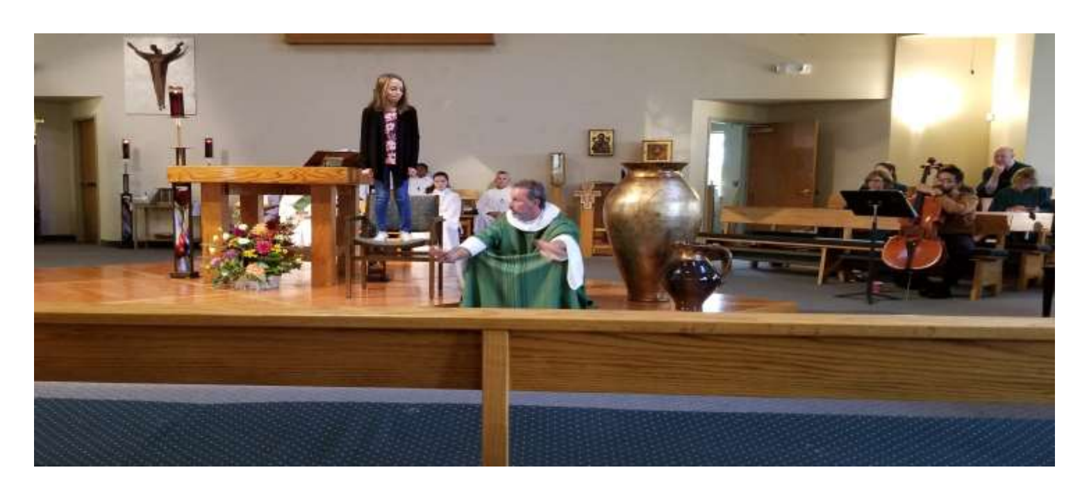
In the Spotlight: What are our young people's dreams and aspirations? This wonderful young lady wants to be a nurse specializing in helping Alzheimer's patients. Wow!