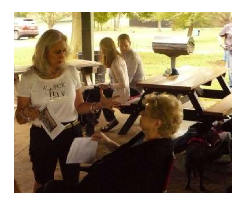
Blessing of the Animals, Pickell Park, Whitehouse Station, October 7, 2018.