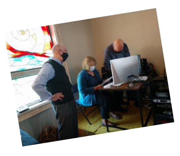
Geek in Training