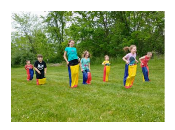
Dave Dabour Photo