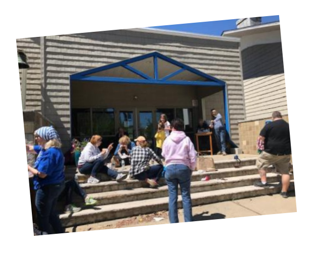
May 1 Cleanup Day