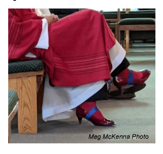
Last Year's Auction Winner Gets Reward!