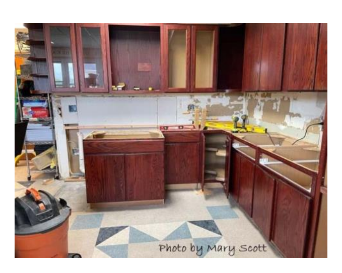
Kitchen Renovation in Progress!