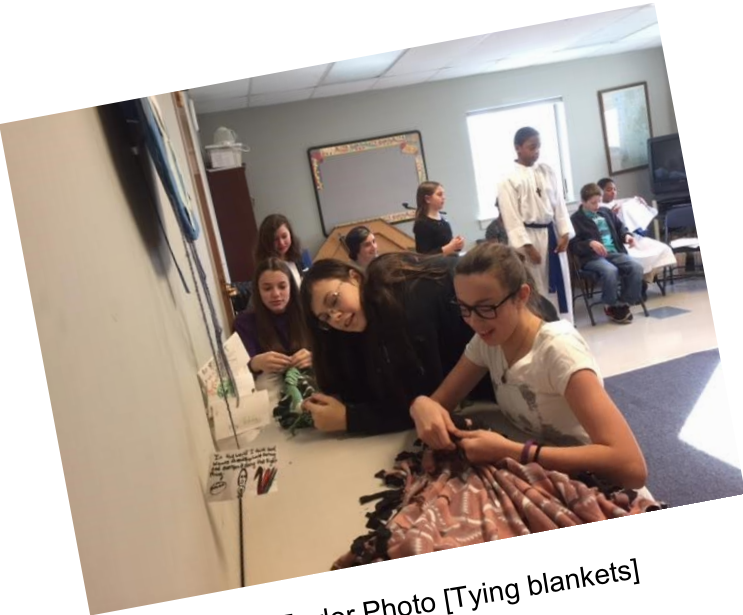
[Tying blankets]