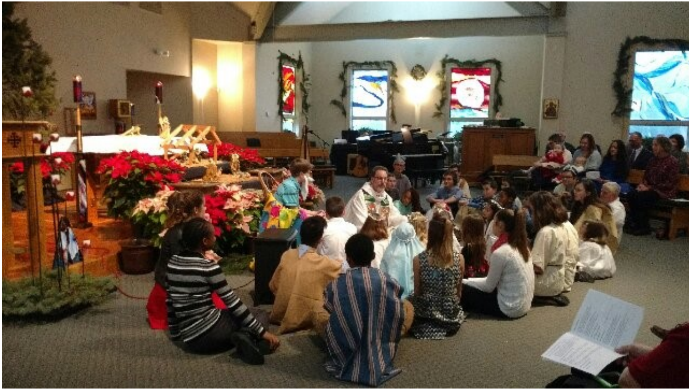
Christmas Eve