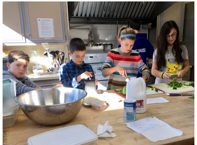
[preparing food for Family Promise]