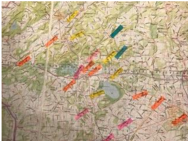
House Blessing Routes 2021